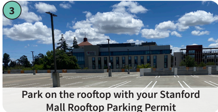
Park on the rooftop with your Stanford Mall Rooftop Parking Permit

A Valid Stanford Mall Rooftop Parking Permit is required for all vehicles parking in this area.