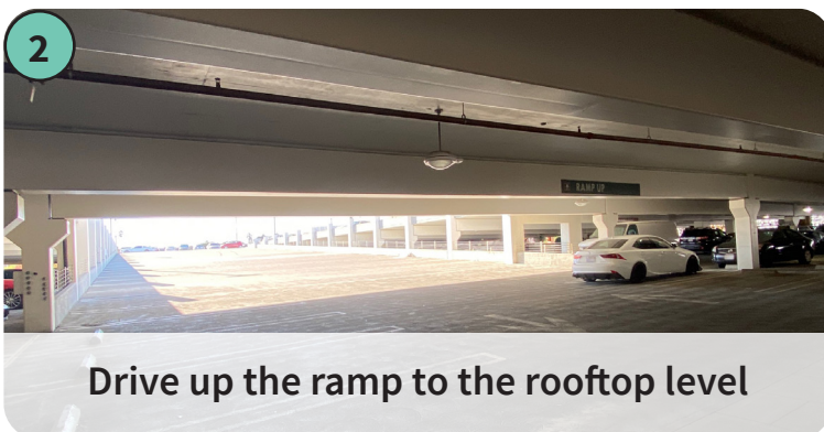
Drive up the ramp to the rooftop level