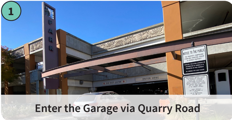
Enter the Garage via Quarry Road