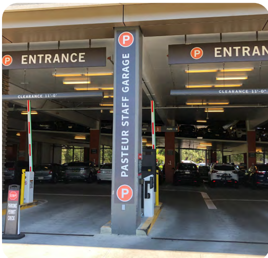
The gate arms can be opened with the app at 500P - Pasteur Staff Garage