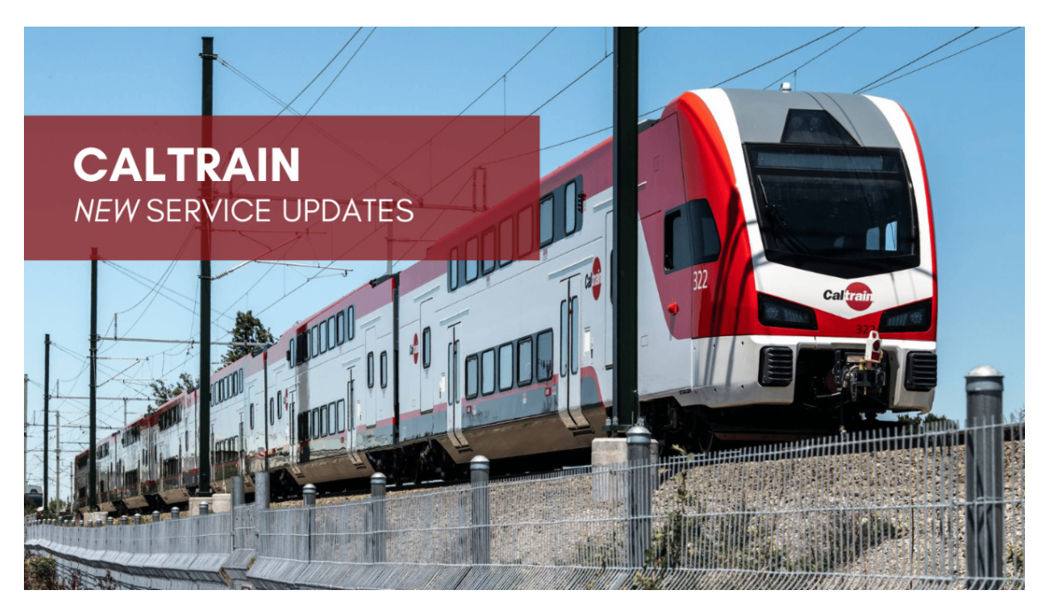
Caltrain is a commuter rail service that provides convenient transportation to San Francisco, San Jose, and surrounding communities.

Caltrain has announced two exciting new updates for their commuter rail service!