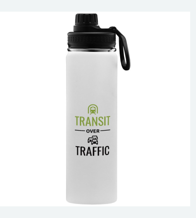
Quantities are limited and first come, first serve!