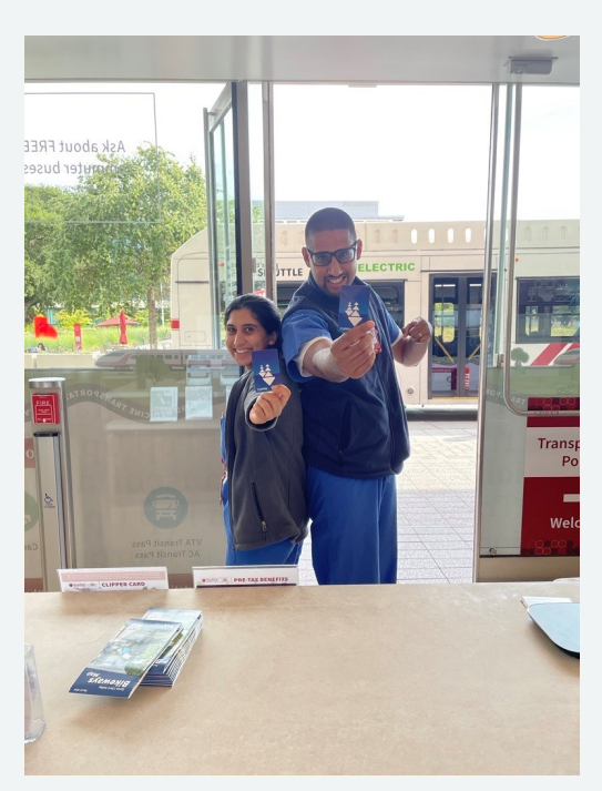
Resident doctors posing with their Clipper cards at the Transportation Pop-Up

To learn more about the free Caltrain Go Pass available to qualifying Stanford Medicine employees, click the button below.