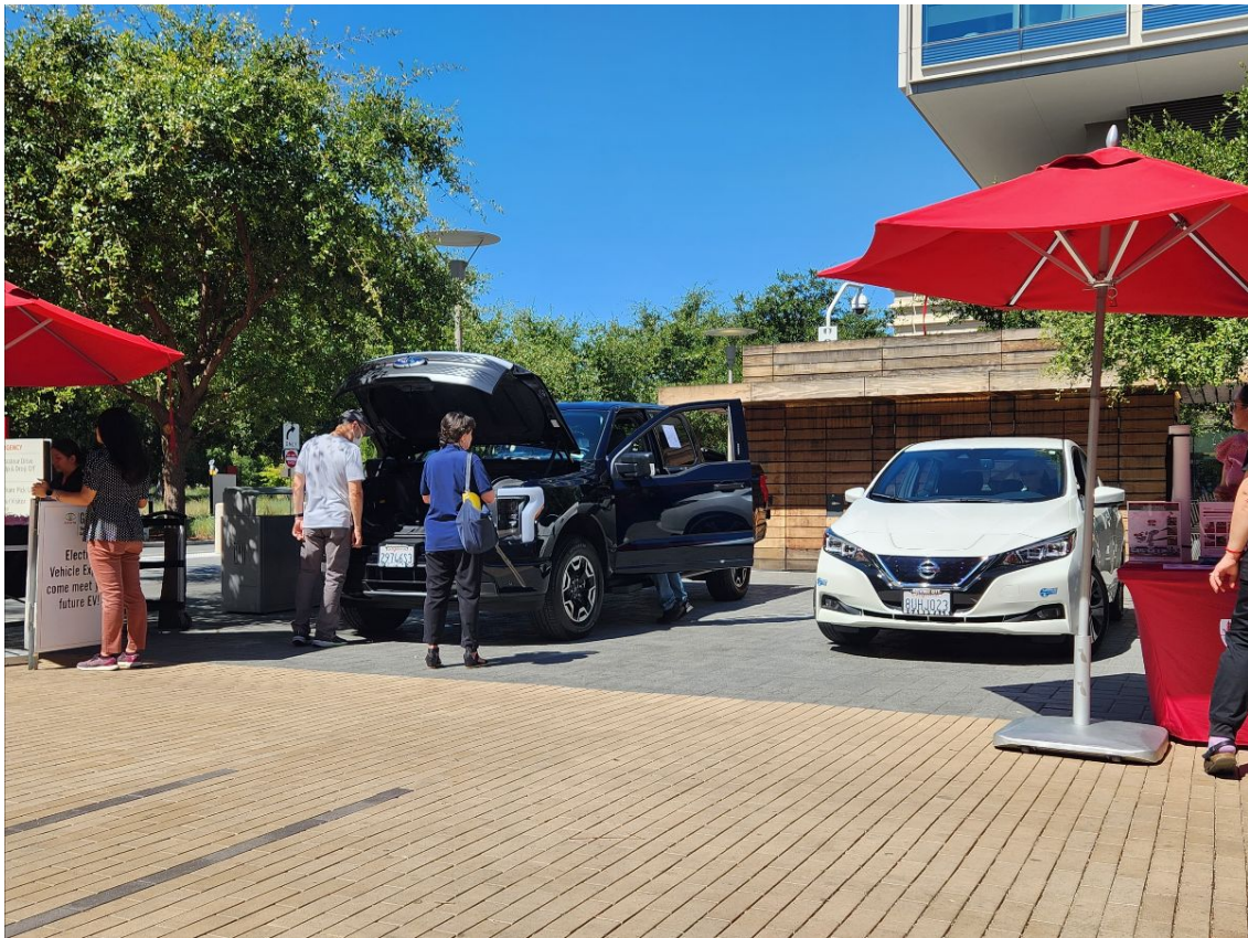
EV Expo - August 16, 2023: the electric vehicles shown in the photo are the Ford F-150 Lightning (left) and the Nissan Leaf (right)

Thank you to everyone who attended the EV Expo at the Spieker Plaza!