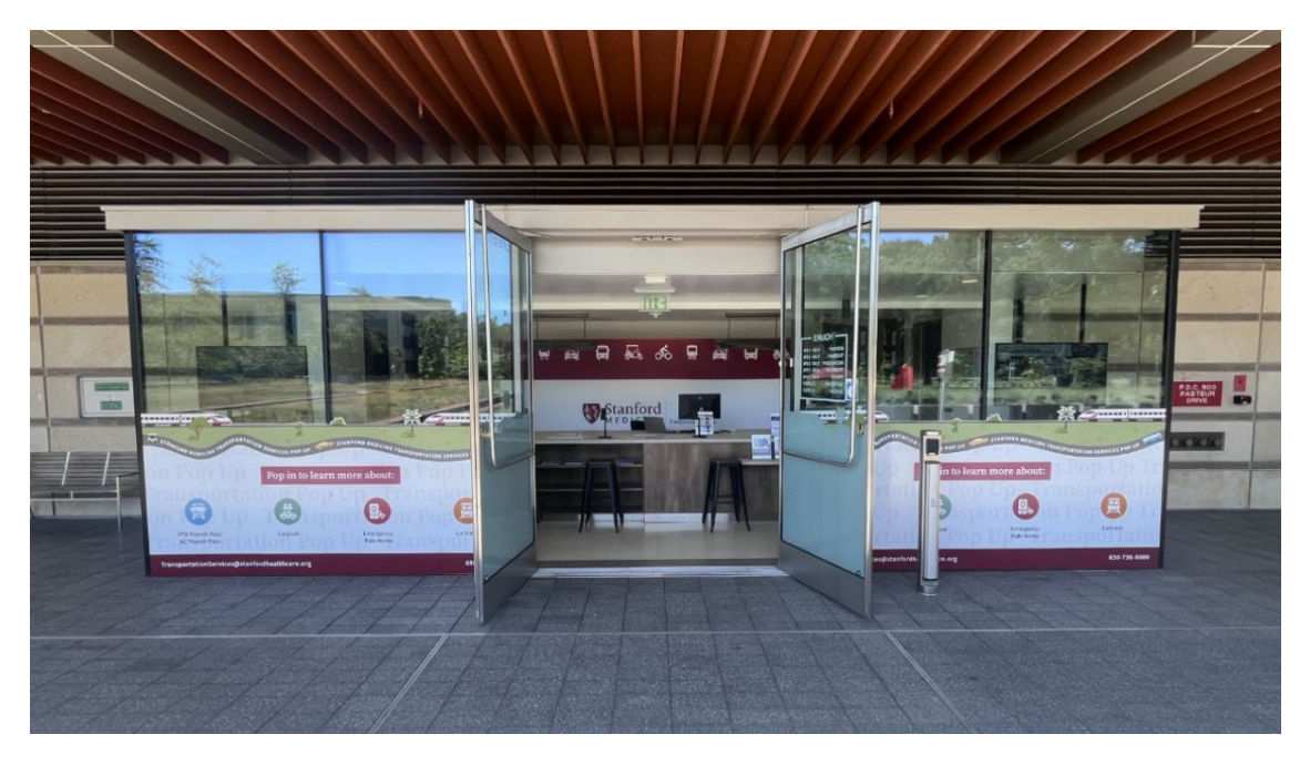
Verify and receive your sustainable prize at the Transportation Pop-Up located on North Pasteur Drive!

Stanford Medicine Transportation Services is excited to announce a limited promotion for staff who take the Campbell or Santa Clara Park & Ride!