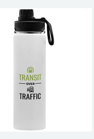
Quantities are limited and first come, first serve!

The Santa Clara and Campbell Park & Ride programs offer free parking, free wifi on shuttles, and a complimentary car wash if you park at the designated Park & Ride lot at least 16 times in a month!