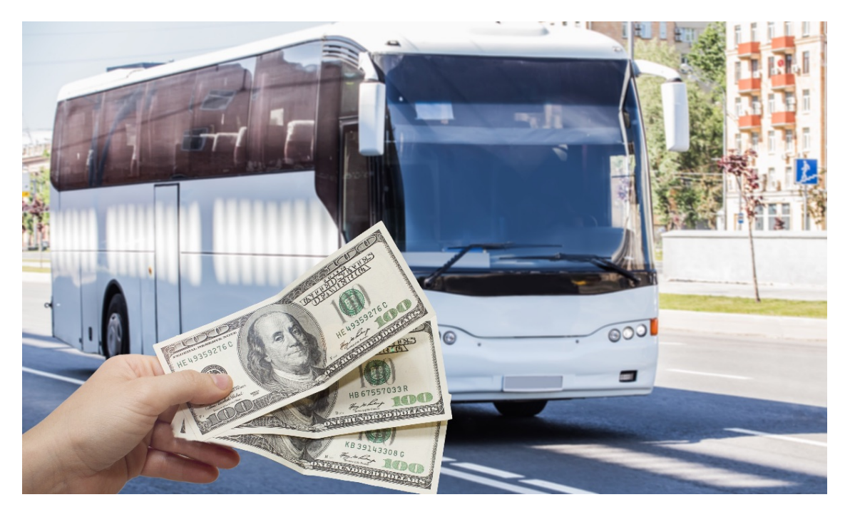
Go green and get rewarded with Clean Air Cash

Are you a full-time benefits-eligible Stanford Health Care & Lucile Packard Children's Hospital employee who works day shift onsite at the Stanford Medicine Palo Alto campus?