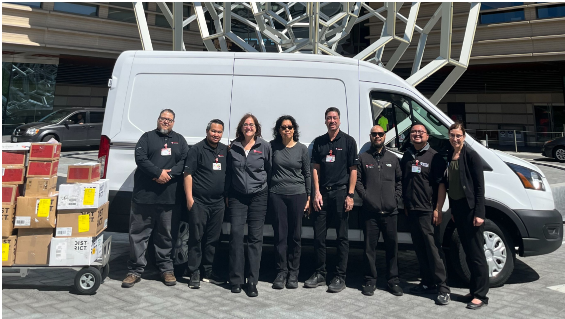
Transportation Services and Technology and Digital Solutions (TDS) team pictured in front of Stanford Health Care's first all-electric cargo van

Transportation Services and Technology and Digital Solutions (TDS) are proud to announce the first all-electric cargo van at Stanford Health Care (SHC)!