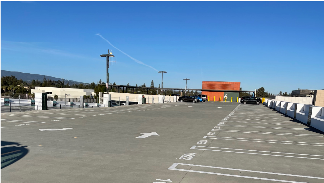
Empty parking stalls at the rooftop of the Hoover Pavilion Garage

Stanford Health Care (SHC) and Lucile Packard Children's Hospital (LPCH) staff can choose to purchase an 'A', 'C', or 'Z' monthly parking permit to access a variety of parking facilities near the main hospital. Some facilities that are currently less congested and are a good option for parking permit holders include: