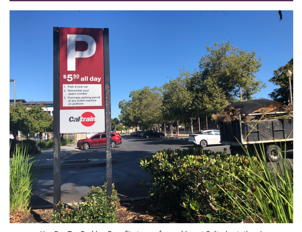
Use Pre-Tax Parking Benefits to pay for parking at Caltrain stations!

Pre-Tax commuter benefits can be used to save on eligible transit and parking expenses including parking at the 500P - Pasteur Staff Garage!