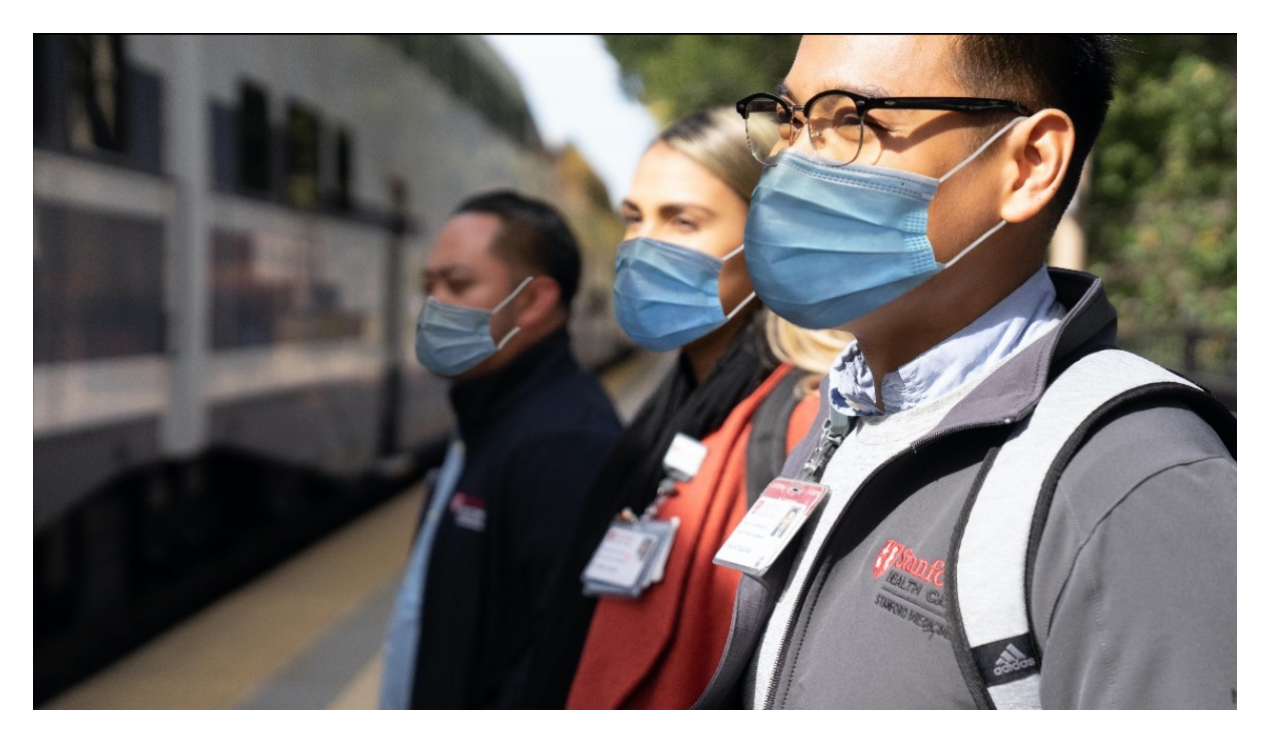
Hospital employees on the main campus who choose a sustainable commuting option may be eligible for a cash incentive!

Are you a full-time benefits-eligible Stanford Health Care & Lucile Packard Children's Hospital employees who works day shift onsite at the main hospital campus?