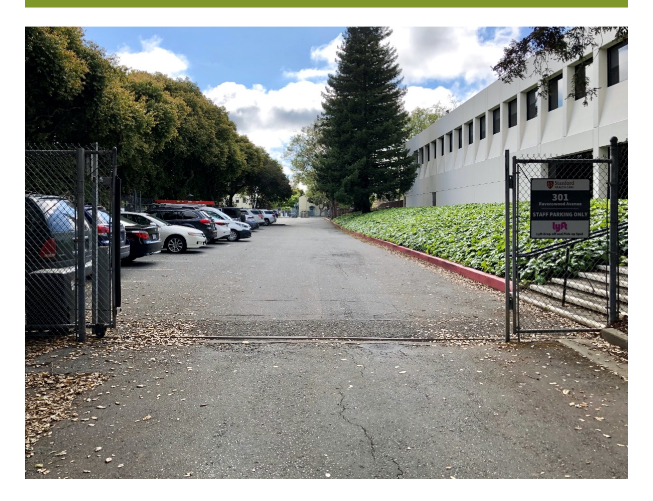
Park for free at the SRI Park and Ride Lot in Menlo Park and gain access to the Yoshi Fuel & Wash program

The SRI Park and Ride Lot is just a shuttle ride away!