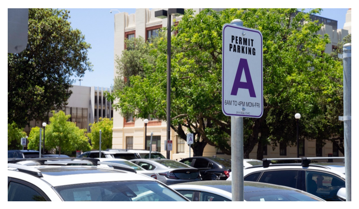
Stanford University 'A', 'C', and 'Z' parking permits are a convenient monthly parking option for staff

Now, your monthly 'A', 'C', or 'Z' parking permit can be extended as far into the future as you'd like! Just simply set it and forget it!