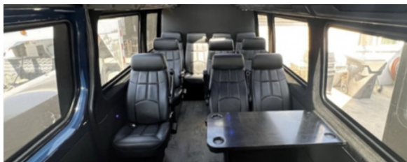
Inside of the commuter shuttle.