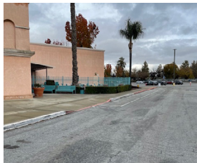
Alameda Fairground Park & Ride lot bus stop.