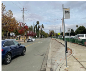
Pleasanton Altamont Commuter Express bus stop.