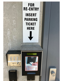
Garage Side Entrance Ticket Reader