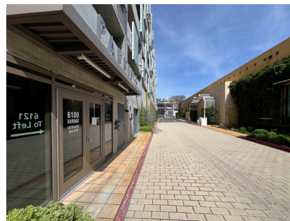
6121 Hollis Side Entry