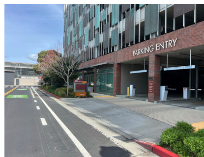
6100 Horton Street Garage Parking Entry