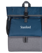
"Breaktime Kooler" Stanford University Cash Value - $48