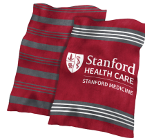
Plush Blanket Stanford Health Care Cash Value - $75