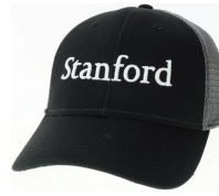
Cap Stanford University Cash Value - $36