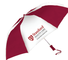
Water Bottle Lucile Packard Children's Hospital Cash Value - $21