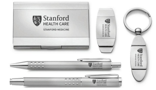
5 Piece Desk Set Stanford Health Care Cash Value - $52