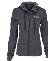
Hoodie Stanford Health Care Cash Value - $90