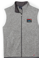
Vest Horizon Cash Value - $85