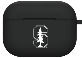
Air Pod Pro Case Stanford University Cash Value - $15