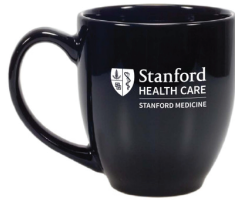
Mug Stanford Health Care Cash Value - $15