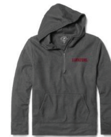
Archive Hooded Stanford University Cash Value - $85