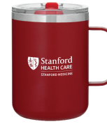
Thermal Mug Stanford Health Care Cash Value - $20