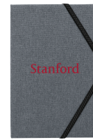
Journal Stanford University Cash Value - $20