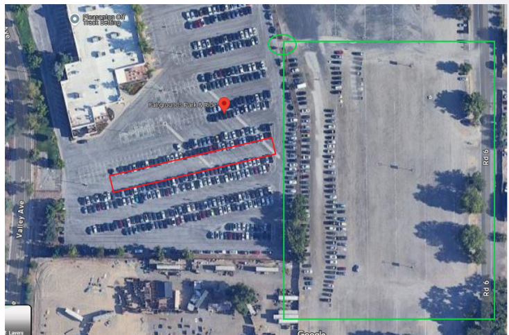
Alameda Fairground Park & Ride lot

*Using the Park & Ride could save staff $1,820 a year on bridge tolls ($7 per day, 5 days a week). By not buying a Stanford University monthly parking permit you could save an additional $480-$1,596 a year (depending on monthly parking permit type). If you take the Park & Ride instead of driving, you could save about $50 each week on gas, which adds up to around $2,600 a year.