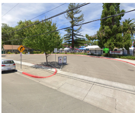
Pleasanton Altamont Commuter Express bus stop.