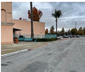
Alameda Fairground Park & Ride lot bus stop.