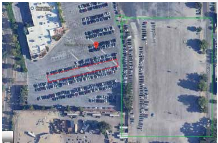
Alameda Fairground Park & Ride lot

*Using the Park & Ride could save staff $1,820 a year on bridge tolls ($7 per day, 5 days a week). By not buying a Stanford University monthly parking permit you could save an additional $480-$1,596 a year (depending on monthly parking permit type). If you take the Park & Ride instead of driving, you could save about $50 each week on gas, which adds up to around $2,600 a year.