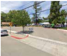
Pleasanton Altamont Commuter Express bus stop.