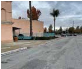
Alameda Fairground Park & Ride lot bus stop.