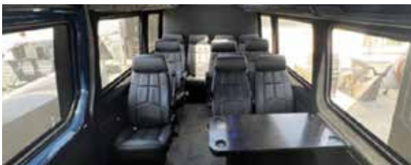
Inside of the commuter shuttle.