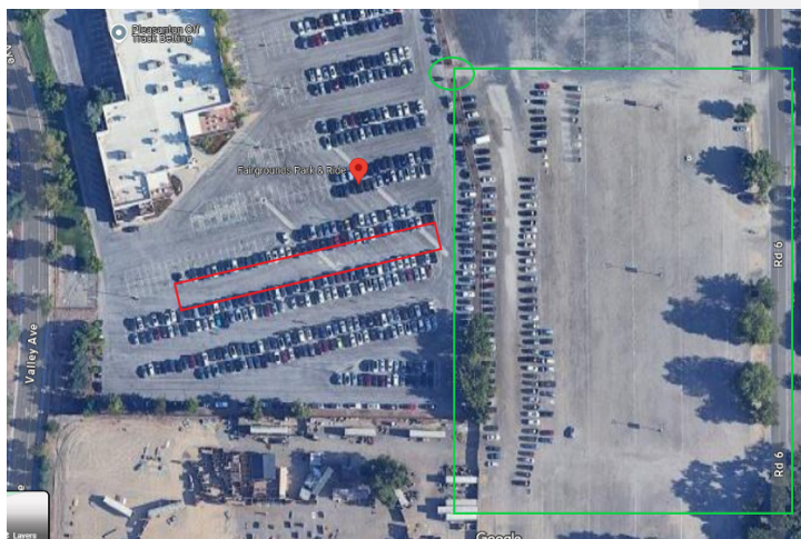
Alameda Fairground Park & Ride lot

*Using the Park & Ride could save staff $1,820 a year on bridge tolls ($7 per day, 5 days a week). By not buying a Stanford University monthly parking permit you could save an additional $480-$1,596 a year (depending on monthly parking permit type). If you take the Park & Ride instead of driving, you could save about $50 each week on gas, which adds up to around $2,600 a year.